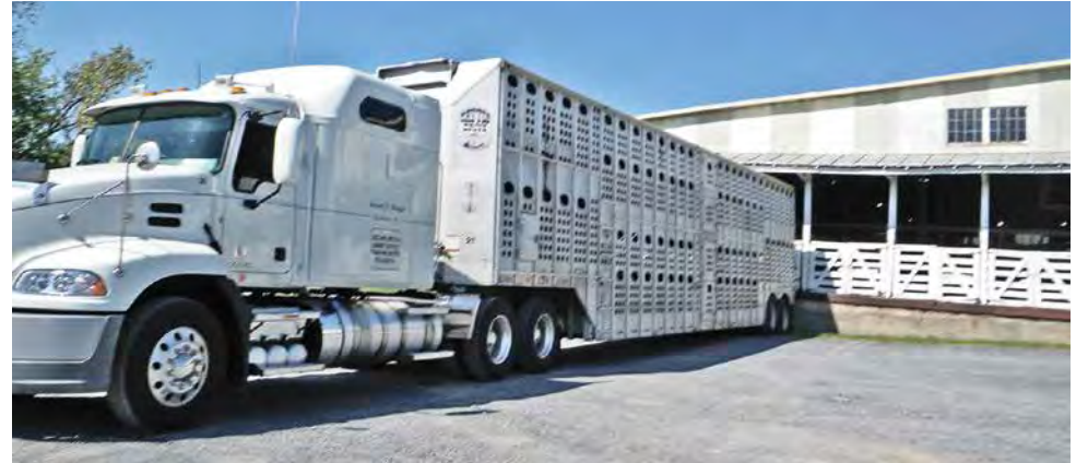
Figure 1. Livestock Arriving at an Auction Yard, J.P. Hewlett

It is important to carefully consider risk when developing your market strategy. You should evaluate any downside price risk protection when it is available. Livestock Risk Protection (LRP) insur-