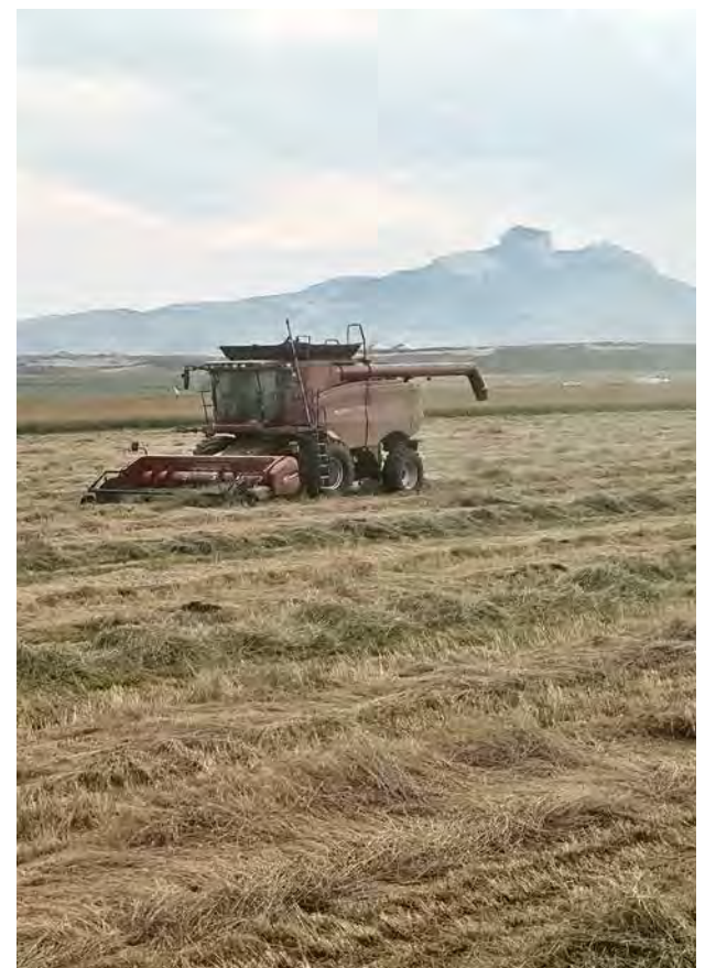
Combining grass seed on Heart Mountain.

thousand dollar rise in 2022. I can combat the increase with the input cost I put into my farm and budget accordingly, but the elderly landowner on a fixed income doesn't have this luxury and it is becoming a real issue for Park County. The high real estate values also directly affect our workforce. Affordable housing is next to impossible to find in Park County. Many are traveling from neighboring counties, which in turn, raises their housing costs.