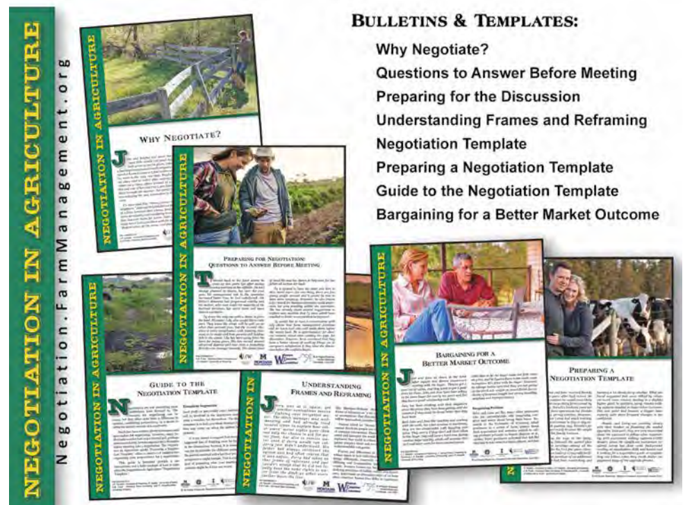
Figure 2. Negotiation.FarmManagement.org